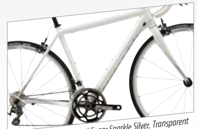
Magnesium White w/ Super Sparkle Silver, Transparent Pearl (05) - WHT