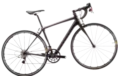
SYNAPSE CARBON WOMEN'S

Built for the long ride, but made for any ride.