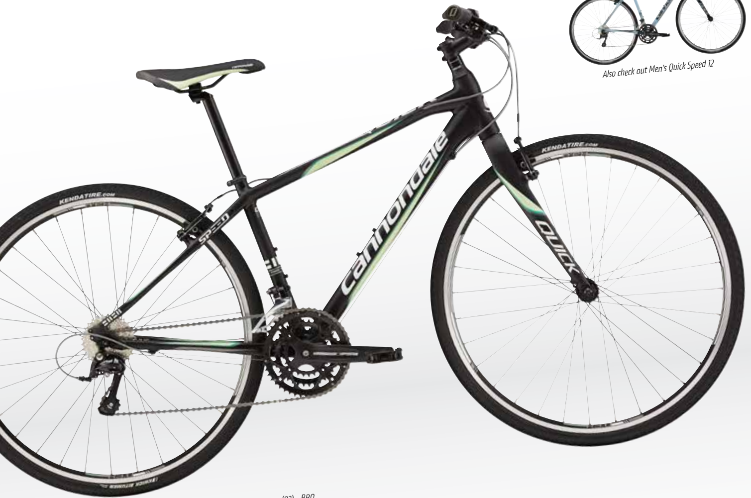
Jet Black w/ Cucumber, Jade and Magnesium White, Matte (02) - BBQ