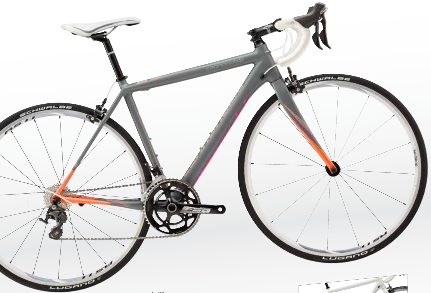
Stealth Grey w/ Haute Pink and Brazilliant, Matte (04) - GRY