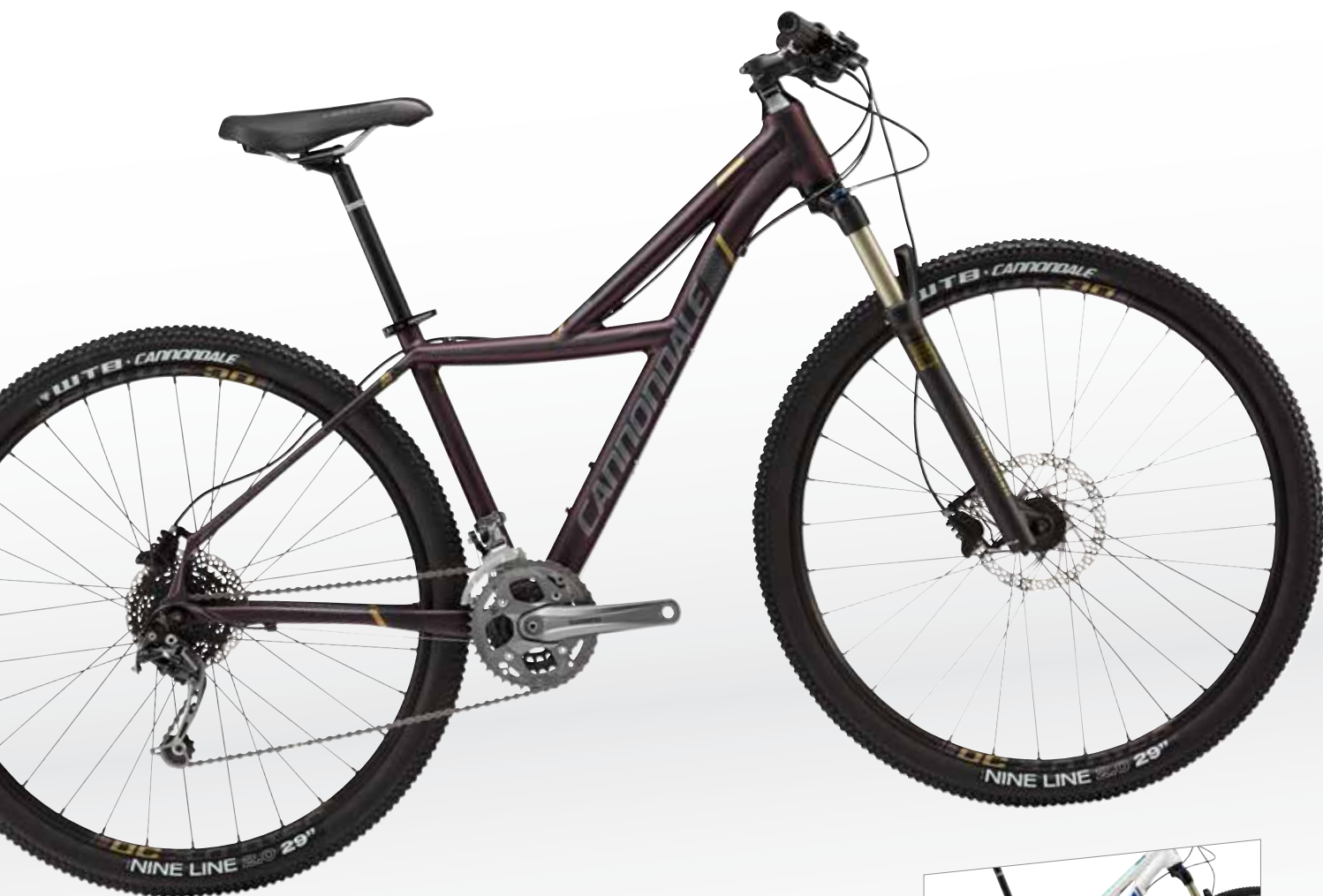
Plum w/ Jet Black and Gold, Matte (03) - PUR