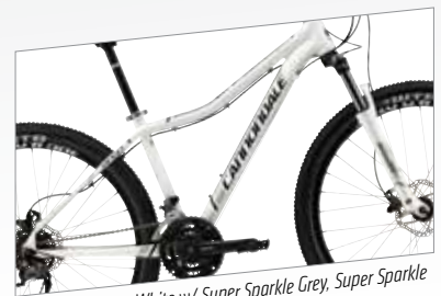
Magnesium White w/ Super Sparkle Grey, Super Sparkle Silver and Jet Black, Gloss (02) - WHT