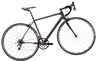
SUPERSIX EVO WOMEN'S