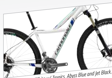
Magnesium White w/ Tropics, Abyss Blue and Jet Black, Class (04) - WHT