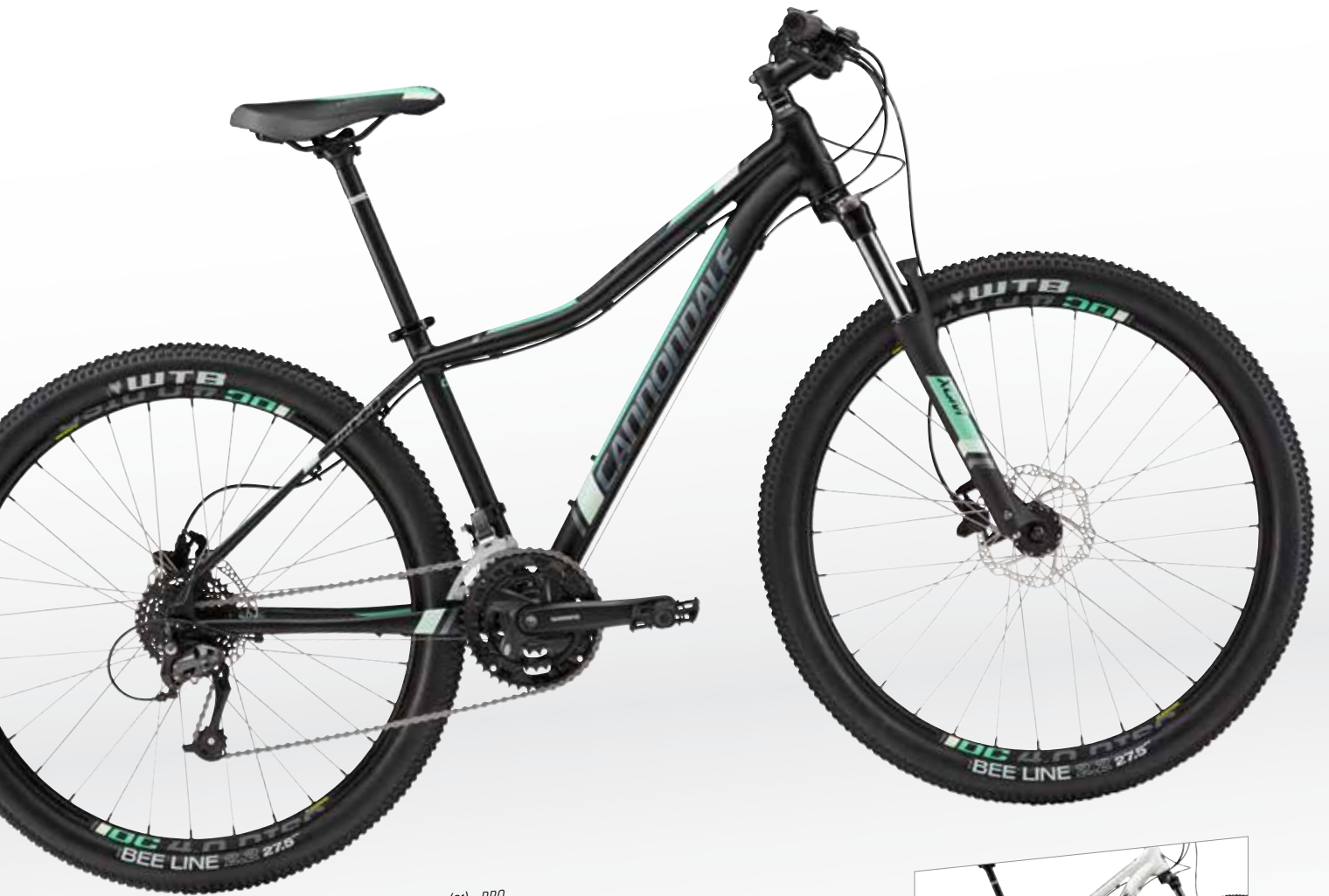
Jet Black w/ Charcoal Grey, Sea and Tropics, Matte (01) - BBQ