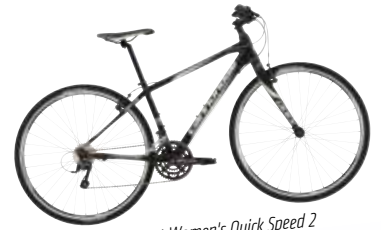
Also check out Women's Quick Speed 2