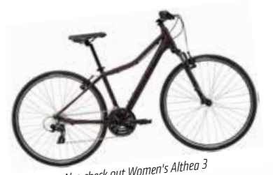
Also check out Women's Althea 3