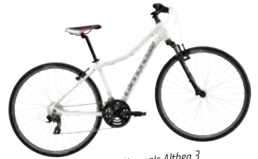
Also check out Women's Althea 3