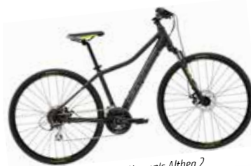
Also check out Women's Althea 2