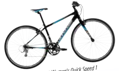
Also check out Women's Quick Speed 1