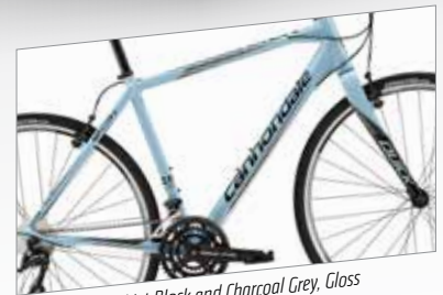
☞ 40 Blue w/ Jet Black and Charcoal Grey, Gloss (04) - BLU