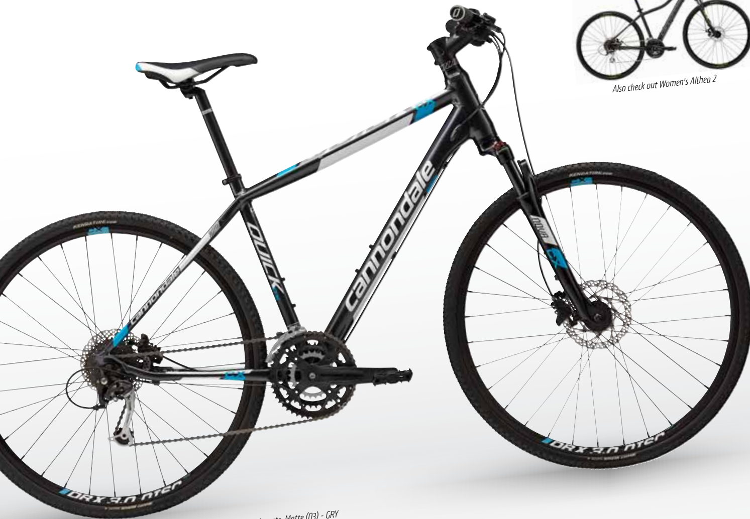
Nearly Black, w/ Magnesium White and Ultra Blue Accents, Matte (03) - GRV