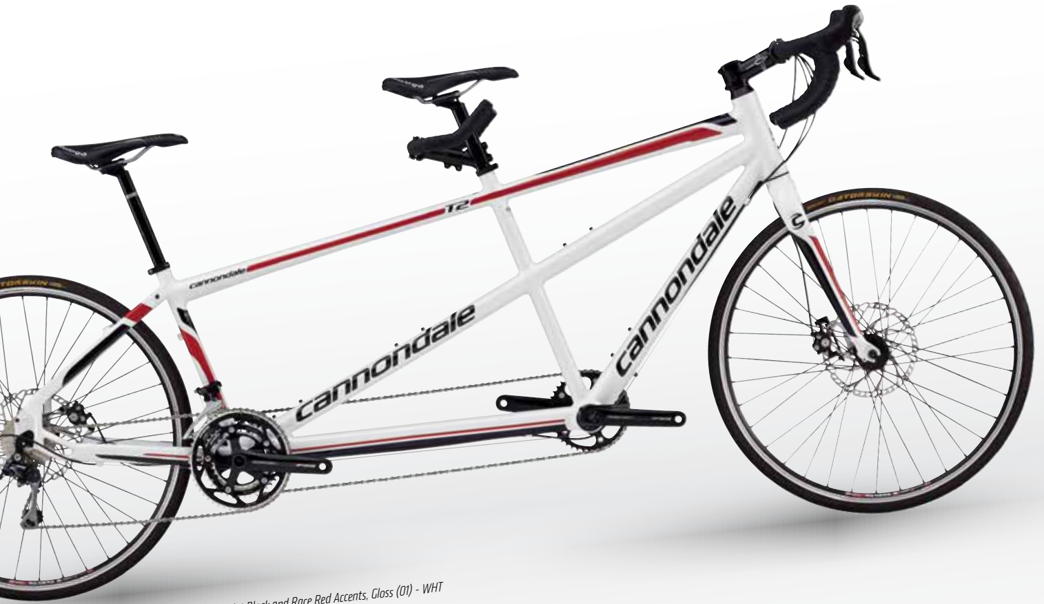
🔑 Magnesium White, w/ Jet Black and Race Red Accents, Gloss (01) - WHT