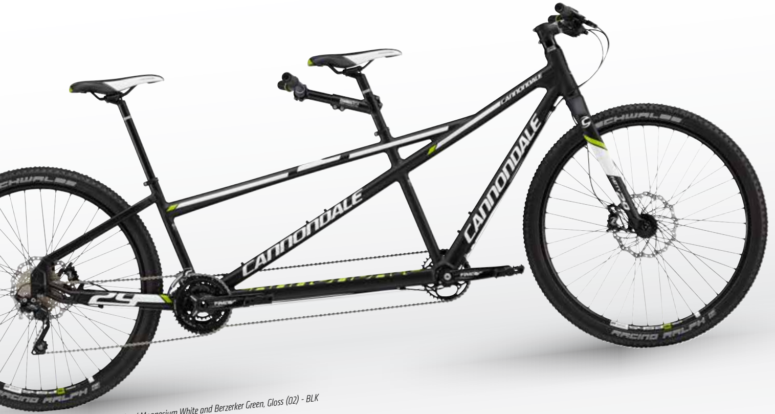
Jet Black w/ Magnesium White and Berzerker Green, Gloss (02) - BLK