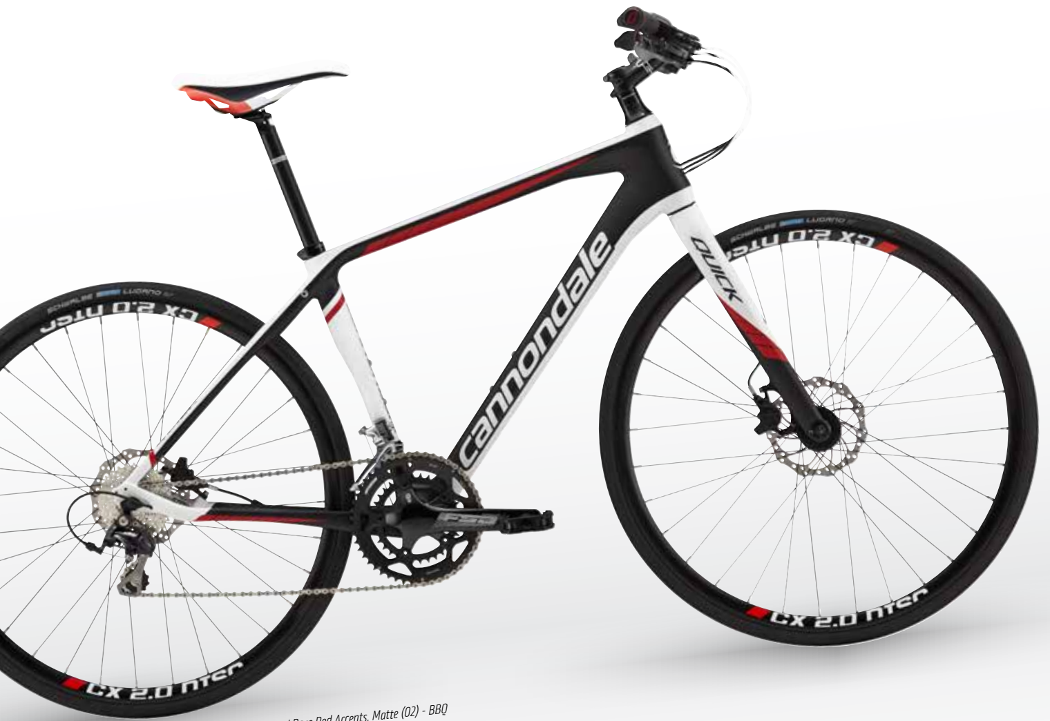
Jet Black, w/ Magnesium White and Race Red Accents, Matte (02) - BBQ