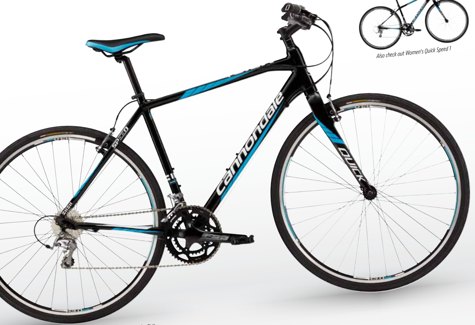
Jet Black w/ Ultra Blue Accents, Gloss (02) - BLK